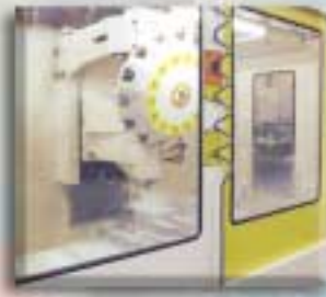
CNC Machining Center