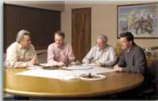
Design Review Meeting