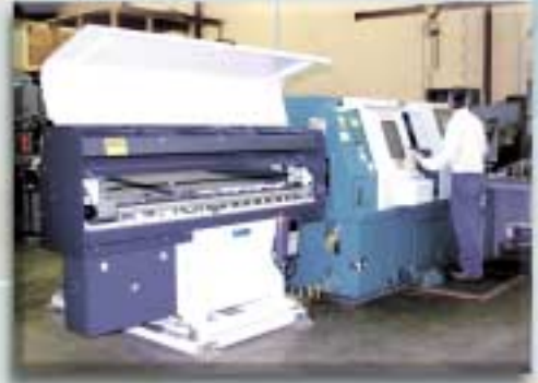
CNC Turning Center